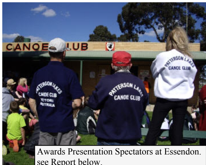
Awards Presentation Spectators at Essendon. see Report below.