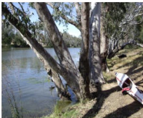
Loddon River Bank

For many it was their first time sprint event and for others their first time for a while. Everyone had a chance to share in both personal and club success and whilst attendance numbers were modest (around 45 for the 20km and 10km Marathon event and about 60 for the Sprints) it was an enjoyable weekend and reasonably well run by Bendigo Canoe Club.