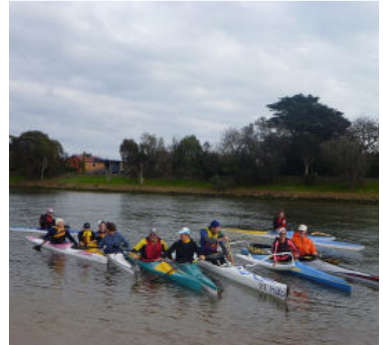
Sunday morning time trialist's. Come and join them.