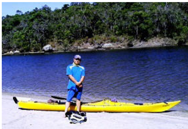
The old Whaleing station.