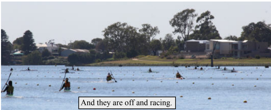
And they are off and racing.